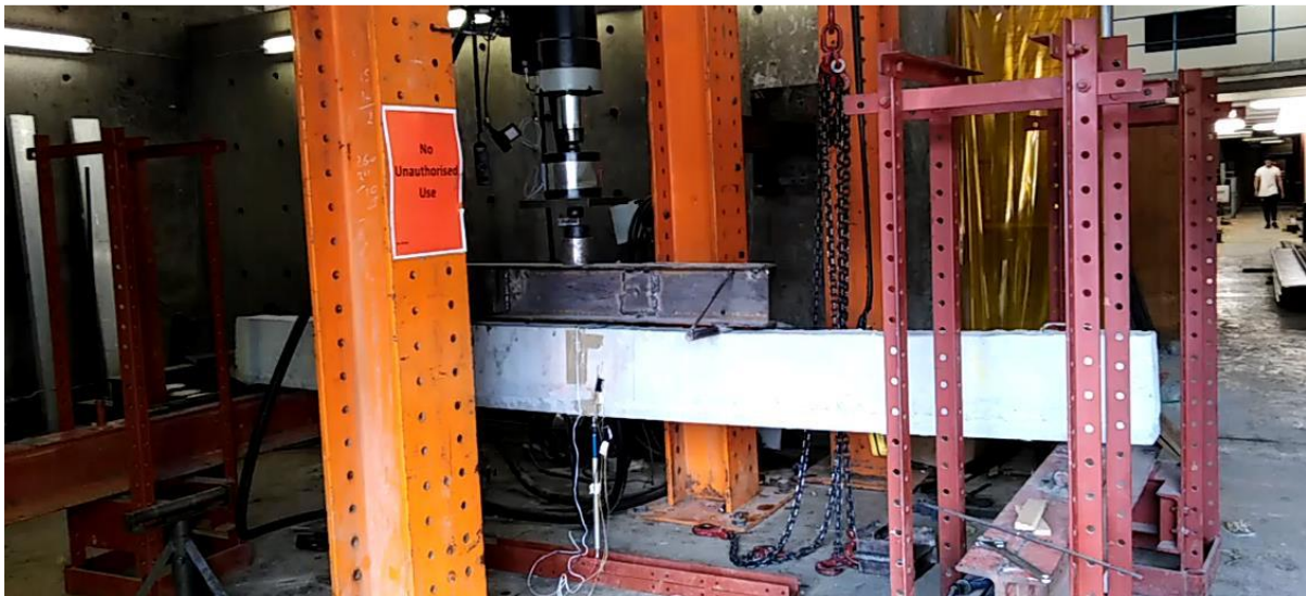
Figure 2: Test setup for beam in bending test

For the shear tests, two roller supports were placed at 900mm apart. The beam was loaded in the centre with the load actuator. The load, time and displacement were logged in a National Instruments data logger.