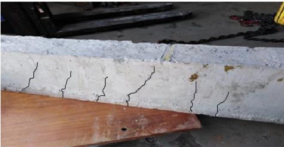
Figure 4: Crack pattern of beam in bending