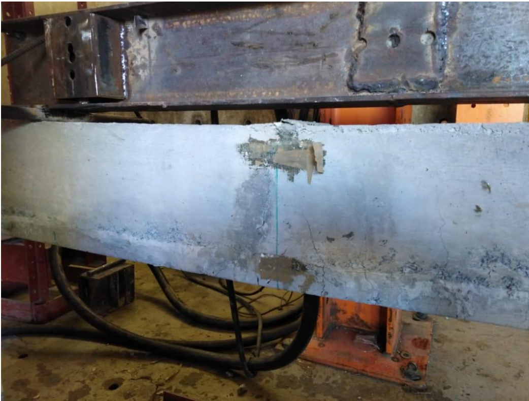
Figure 3: showing midpoint cracking of beams failing in bending

The short beams failed by shear failure while the long beams all failed in flexure.